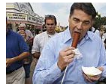
Rick Perry tries to explain his offensive remarks with offensive remarks