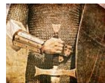
There Are 7 Types of English Last Names — Which One Is Yours? (Ancestry.com)