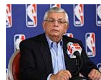
The 10 Wealthiest NBA Players in the World (Worthy)